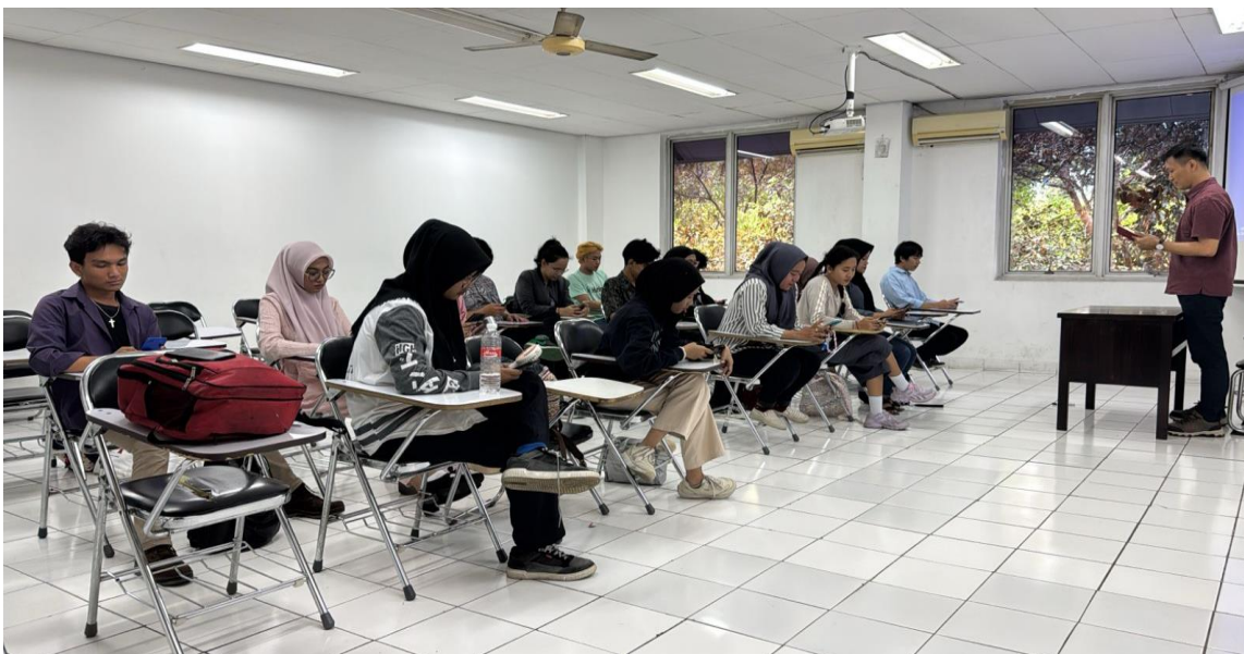
Figure 1. Implementation of the Hypnolearning Model in Class.

Currently, there are many challenges faced by students in learning Mandarin, especially those related to mastering Chinese characters and correct tonal pronunciation. Previous studies have shown that test anxiety, difficulty in remembering characters, and inability to concentrate are the main obstacles to learning Mandarin [4]. To overcome this, various methods have been developed, one of which is hypnolearning. In this concept, relaxation and focus techniques used in hypnosis are believed to improve students' memory and concentration [5].