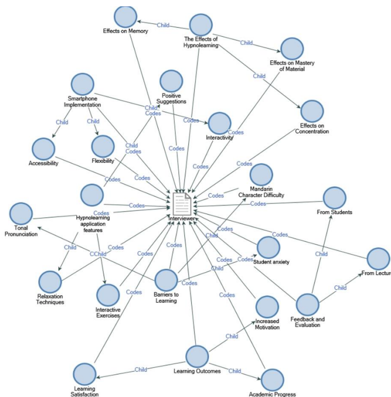
Figure 2. Interview Map.

Learning Mandarin presents unique challenges, especially in understanding complex written characters and tonal pronunciation that affect word meaning. To overcome these obstacles, the hypnolearning approach, which integrates relaxation techniques and positive suggestions, has been implemented through a smartphone-based application. This approach not only helps students improve concentration and memory but also provides greater learning flexibility through modern technology. To understand the application of this model in depth, this study analyzes various aspects of the influence of hypnolearning, technology implementation, learning barriers, and outcomes achieved. Figure 1 presents an interview map that summarizes the main findings related to the application of the hypnolearning model in learning Mandarin through a smartphone application.