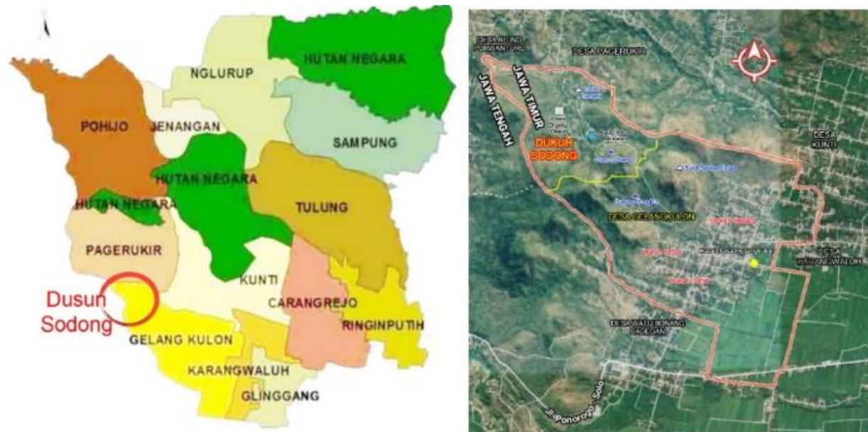
Figure 1. Map of Sodong Hamlet, Gelangkulon, Sampung, Ponorogo, East Java [5].

The population of Sodong Hamlet is 482 people and the majority of their education level is up to junior high school. The livelihood of the population is generally farming. They grow corn, cassava and other tubers. Apart from farming, some residents raise livestock (goats and cows). Not a few families/households live in the vulnerable category of poverty and below the poverty line (of IDR 354,547 per capita per month) [6]. This is as per the data in Table 1.